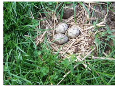
The Sky Lark (left) and the Oyster catcher (right) both nest in the margins between the beach and nature reserve and don't stand a chance against 4x4's.